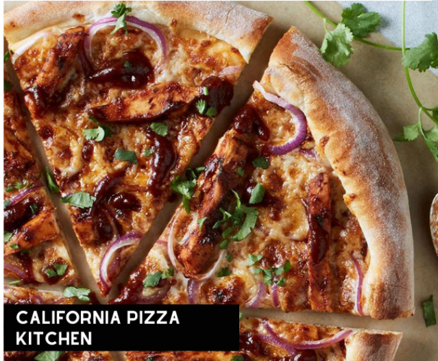
CALIFORNIA PIZZA KITCHEN