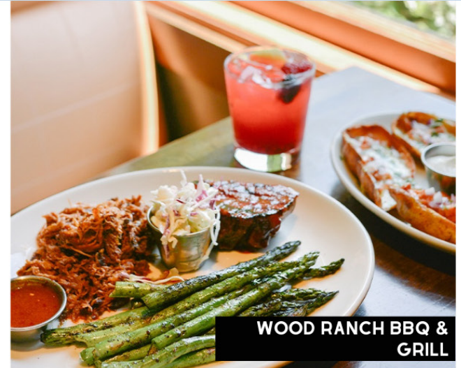
WOOD RANCH BBQ & GRILL