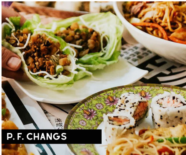
P. F. CHANGS