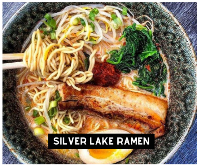
SILVER LAKE RAMEN