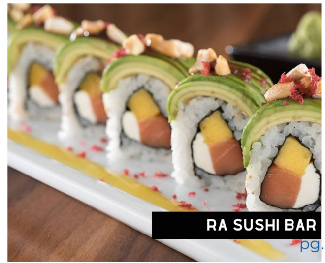
RA SUSHI BAR