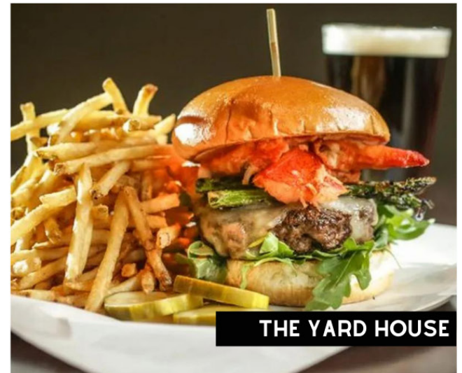
THE YARD HOUSE